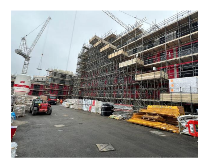
Block A (Right) and Block CI (Background) from the Dawes Road site entrance