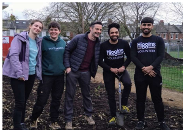
Earthwatch Europe Tiny Forest Planting Day at Frank Banfield Park

We have also been working with the charity 'Earthwatch Europe' and took part in their Tiny Forest Planting Day at Frank Banfield Park . Our two volunteers worked hard and helped plant over 600 seeds to start the growth of a tiny forest within the park.