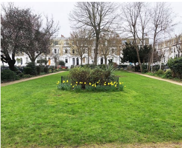
Westcroft Square in Hammersmith brings the number of H&F parks with a Green Flag Award to 20

We'll continue our already substantial investment in preventing young people becoming victims of gang crime and exploitation by identifying those at risk of becoming involved. This means providing effective early-intervention strategies and offering long-term support and guidance to help our young people steer clear of gangs. We'll identify, disrupt and act against specific gangs and provide ongoing support for victims, working with concerned families to enhance the impact of our outreach work.