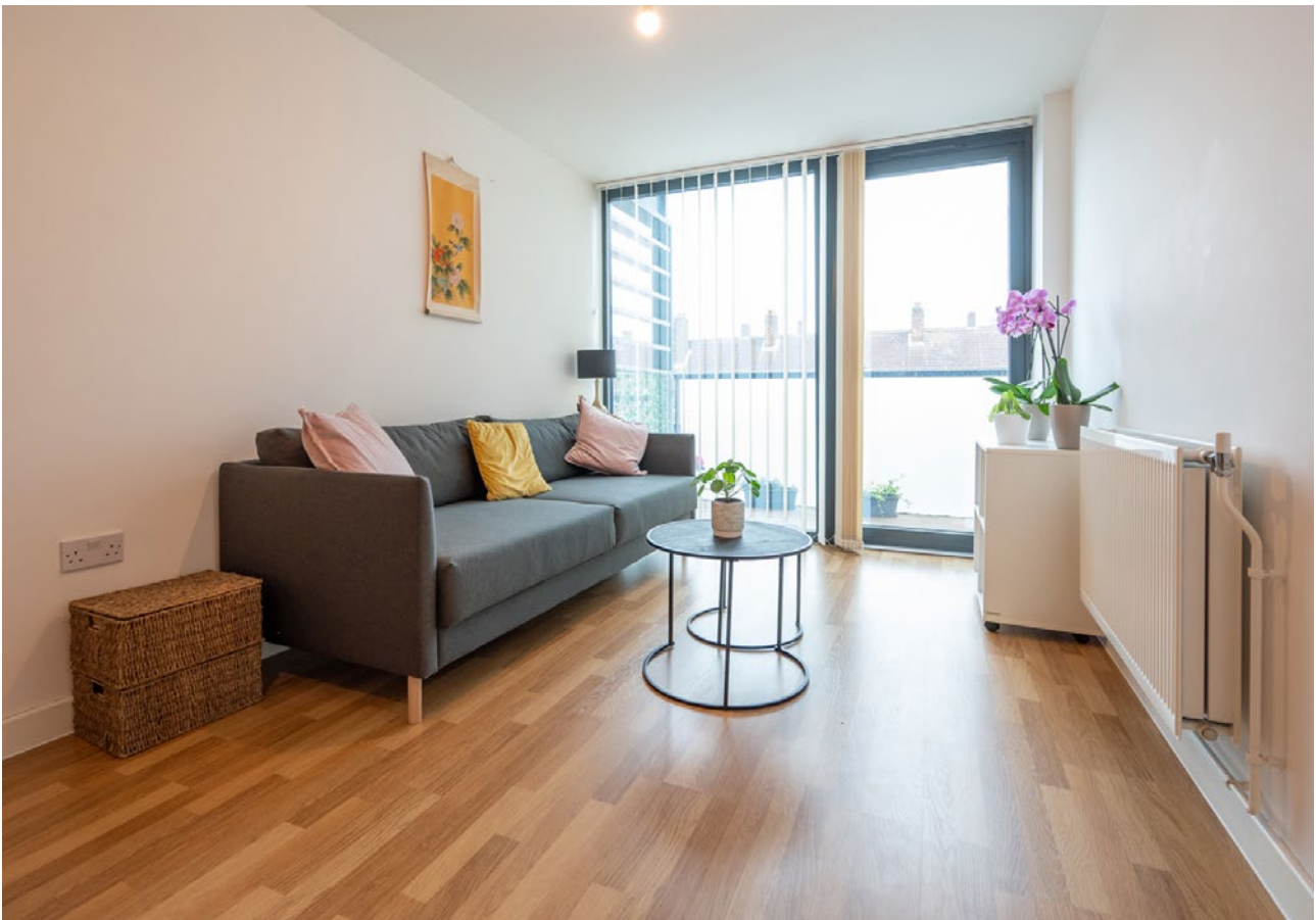
The living room in one of our Homebuy flats

We're spending £1m a week for the next 12 years to refurbish council-owned homes. A new survey of our properties will also help us target the funding to where it's most needed.