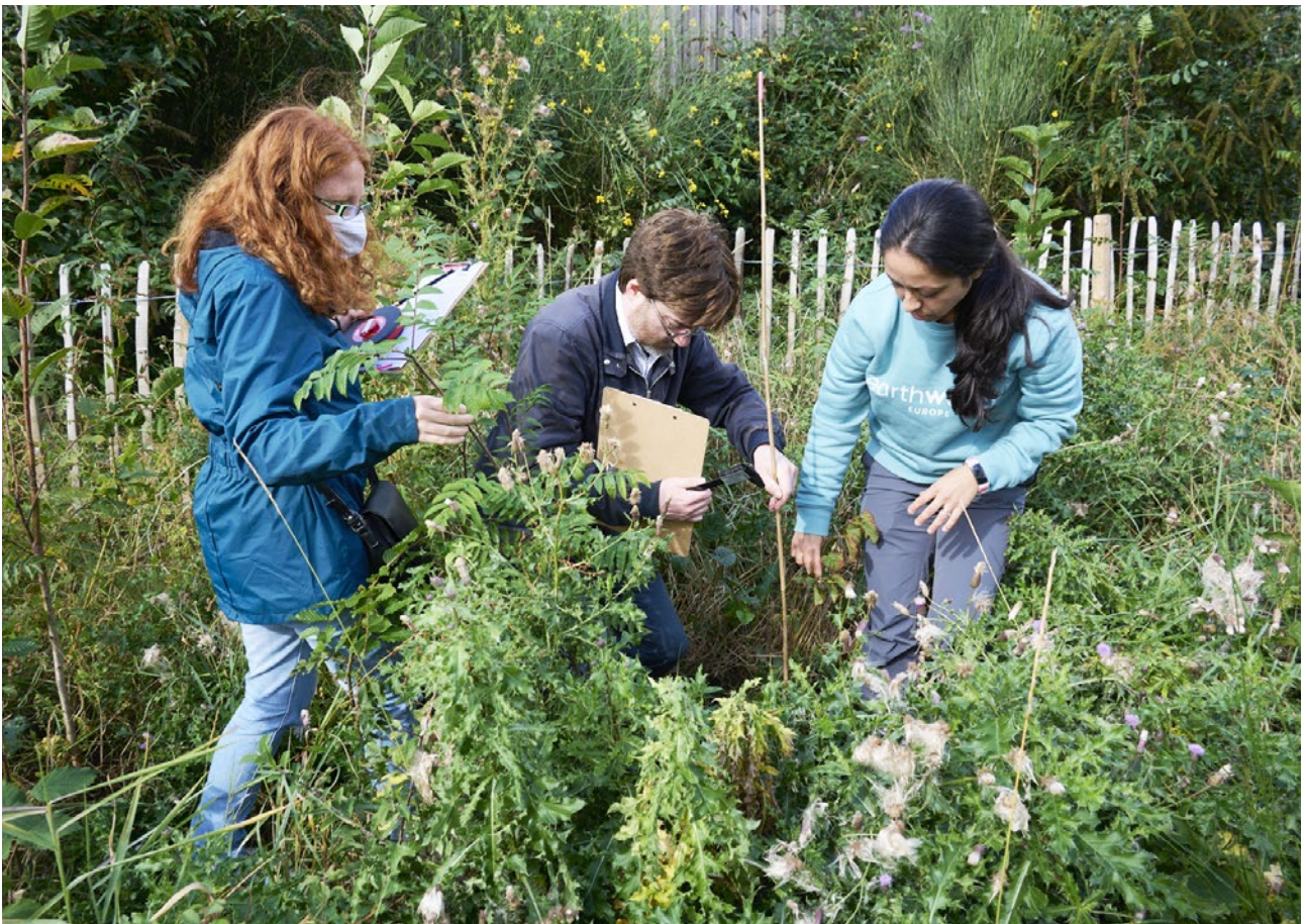
Tiny Forest planting in Hammersmith Park, White City

We'll use emissions-based residents' parking, to reduce parking fees for many residents , with free parking for clean vehicles outside high-volume traffic neighbourhoods, peak times and the school run. This includes focusing on parking restrictions for non-residents and providing improved information to residents about how RingGo cashless parking operates.