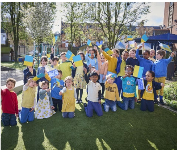
Pupils from Queen's Manor Primary School show their support to the people of Ukraine

We'll renew our pledge to our care leavers to improve their opportunities for independence , by supporting them with training, employment, healthcare and housing.