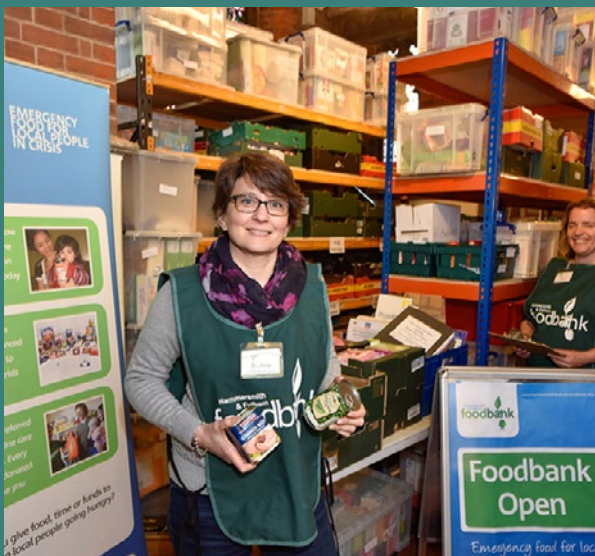
Above: The H&F Foodbank gave out more than 18,000 three-day emergency food parcels in 2020-21 to local people in need

We'll ensure the community schools' programmes at Avonmore and Flora Gardens primary schools are green projects that create high quality learning spaces for our children.