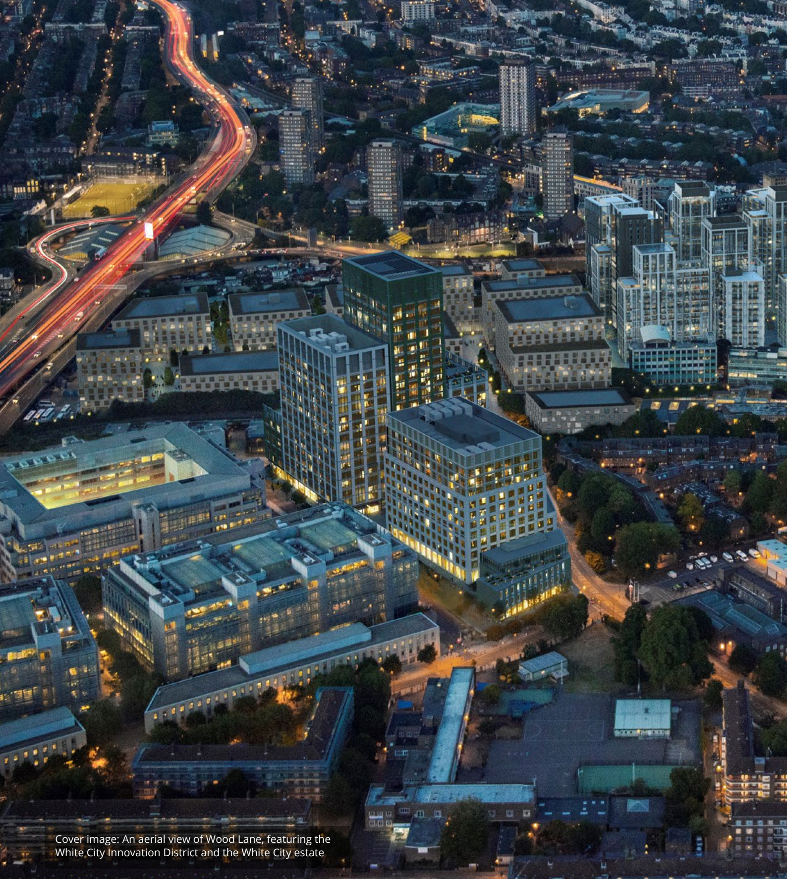
Cover image: An aerial view of Wood Lane, featuring the White City Innovation District and the White City estate