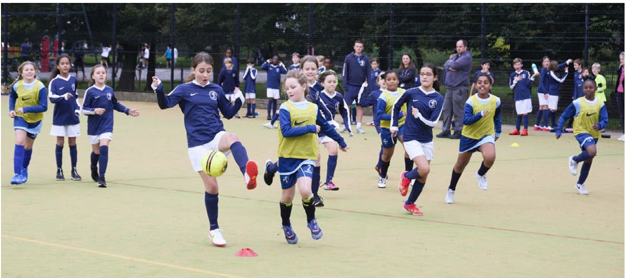
Above: H&F schoolchildren playing football in the Mayor's Cup

I commend it to you and look forward to seeing early results from its implementation.