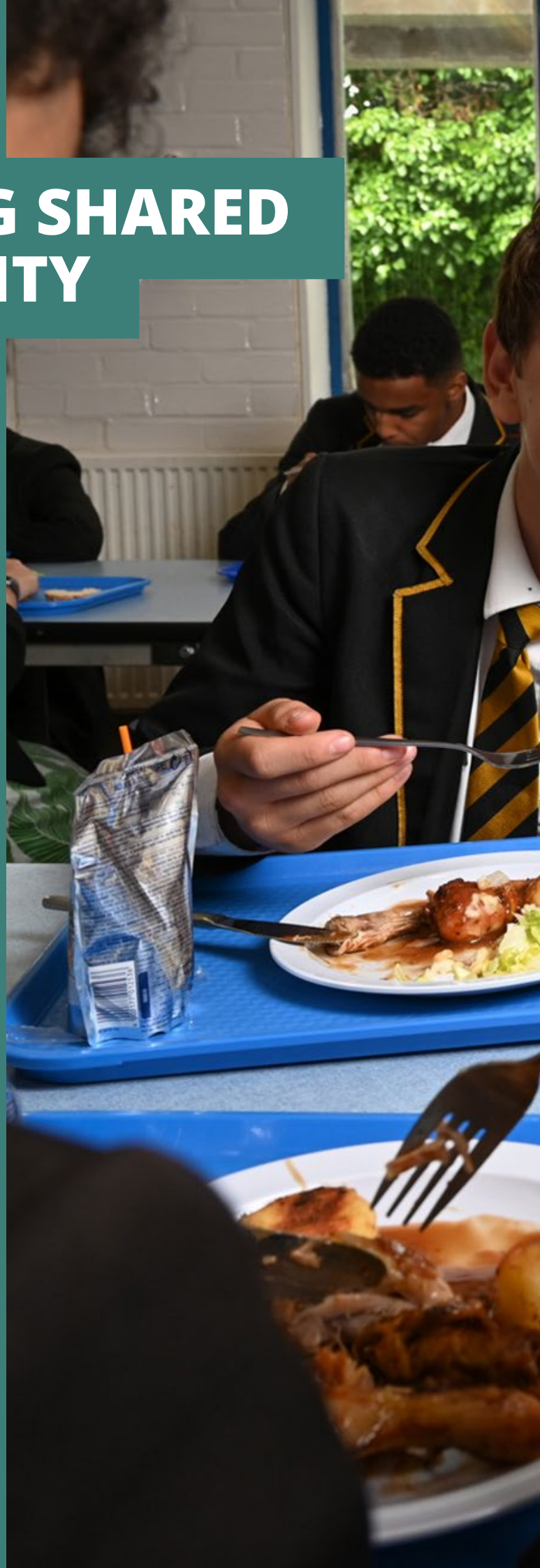
Right: Students from Fulham College Boys' School eating lunch in their school cafeteria