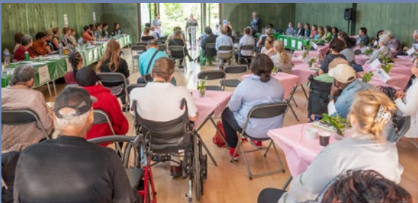
Guests at the Dementia Fair inside Sands End Arts & Community Centre, Fulham

We'll make the borough an even more dementia-friendly community and implement the H&F Dementia Strategy . We'll work with the NHS to increase diagnosis and trained support for people living with dementia and offer a range of dementia specific and inclusive activities that give choice and control, reduce social isolation, and provide clear accessible information about how to access services and support.