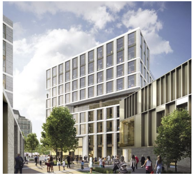
An artist's impression of the EdCity development