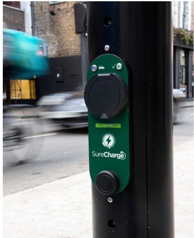
A vehicle charging point in Fulham's North End Road – one of the 3,000 in H&F by the end of the year

We'll build on successes to reduce the Council's carbon footprint by maximising smart working as part of the 'Hello Hybrid Future' programme. We'll explore the use of virtual and community hubs where different agencies will work together and take a wrap-around approach to supporting residents with multiple needs.