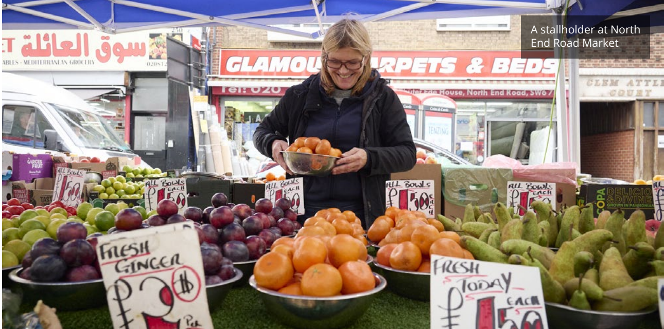
A stallholder at North End Road Market