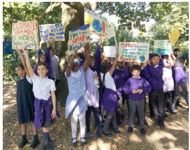
Above: Melcombe Primary School pupils campaign against climate change

We'll implement our Disabled People's Housing Strategy , working in co- production with Disabled residents.