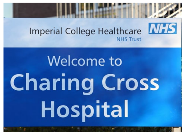
Charing Cross Hospital in Fulham Palace Road

We'll continue to tackle structural racism in health and other services and work to ensure everyone enjoys equity of access, treatment and outcomes no matter what their background or the colour of their skin.