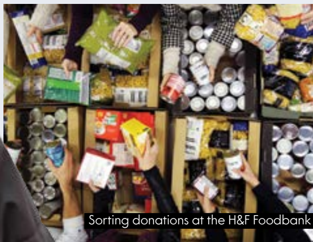
Sorting donations at the H&F Foodbank

We're working with our older people to tackle loneliness and isolation.